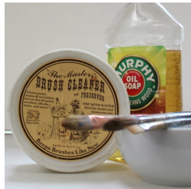
6. Choose a brush soap for cleaning your brushes after the painting session.