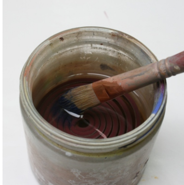
3. Dip brush in Gamblin Gamsol or Safflower Oil to remove residual color.