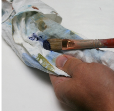
2. Remove color off your brush onto the "dirty" rag.