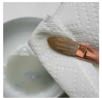
8. Wipe brush on paper towel.