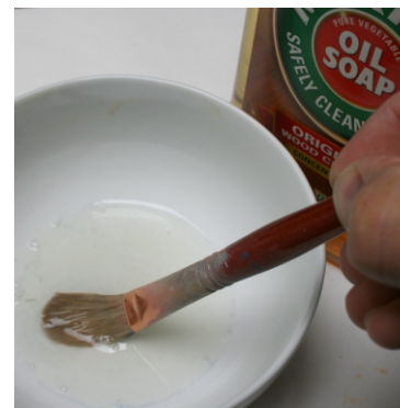
7. Wash the brush in a mixture of brush soap and water in a ceramic bowl.