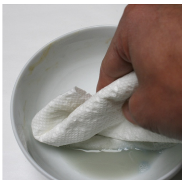
9. Wipe dirty water out of bowl with a paper towel and dispose of in garbage.