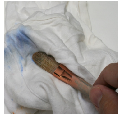
4. Wipe brush on second, "clean" rag.