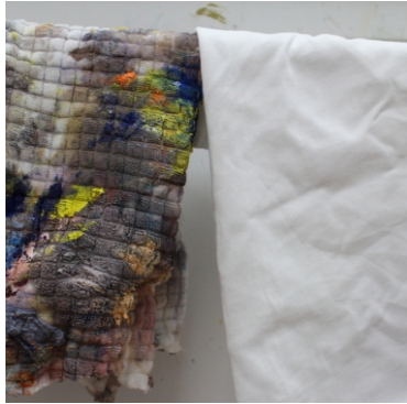
1. Set up a simple, 2-rag system - one "dirty" rag and one "clean" rag.