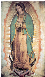
12 de dic. 1531: visión Virgen de Guadalupe, México

10 de diciembre: Last day of instruction