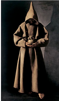
27 de agosto 1662 m. Zurburán, pintor español

Estructuras : Present Subjunctive, subjunctive to express wishes and hope, subjunctive with verbs and expressions of doubt.