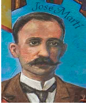
José Martí, 1853-1895, Cuba