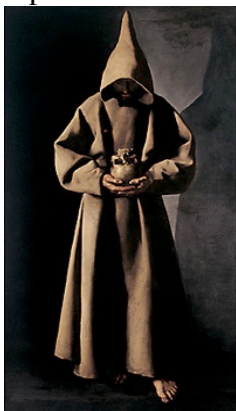
27 de agosto 1662 m. Zurburán, pintor español

Chapter Objectives: At the end of this chapter you will be able to ask and provide information, express needs, ask for prices, talk about daily routines, and ask about and express location.