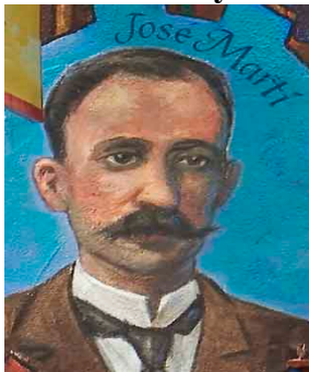
José Martí, 1853-1895, Cuba